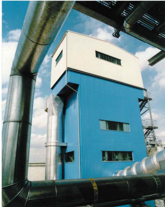
flue gas adsorber

In the new modern wastewater treatment plant, the wastewater resulting from the flue gas cleaning is cleaned and finally drained off into the central sewage plant of Basell.