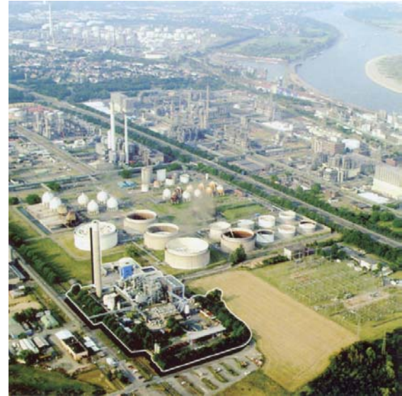
View on the northern part of the industrial area of Wesseling

The company is located in the industrial area of Wesseling in the south-west of the Basell site. This site has junctions to the major regional and supranational traffic connections. The nearest motorway (BAB 555, Köln Godorf) is approximately 2 km away from the site. The harbour "Rheinhafen Godorf" is located in the north-east. A rail connection is nearby.