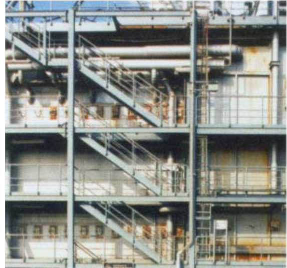
Secondary combustion chamber and boiler

This represents a saving of approx. 25.000 tonnes of fuel oil, sufficient to heat about 6.000 detached houses for a year.