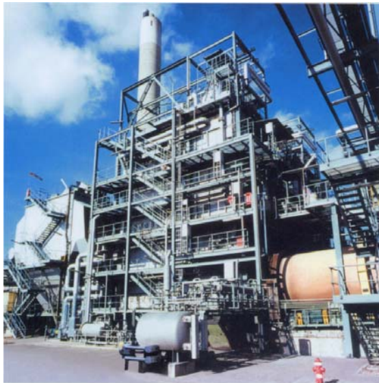
Thermal residue recovery plant

Due to its original function TRV treats waste coming from chemical and mineral oil industries. Comparable waste coming from other industrial fields as well from local sectors, e.g. varnishes, paints and sludges can be recovered, too. Since many years, we have provided an environmentally sound disposal for hospital wastes.